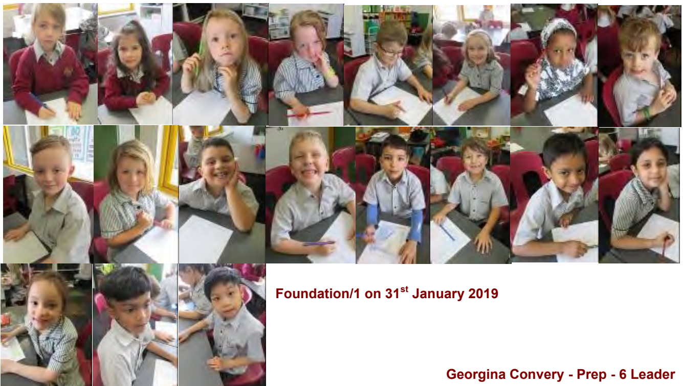
Foundation/1 on 31 st January 2019

School photos will be on Tuesday 5 th March.