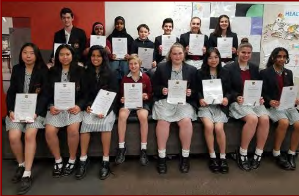
2019/2020 Leadership Inauguration Wednesday 13 th November

Newsletter Issue 18, 20 th November 2019