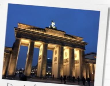
Brandenburg Gate - Berlin